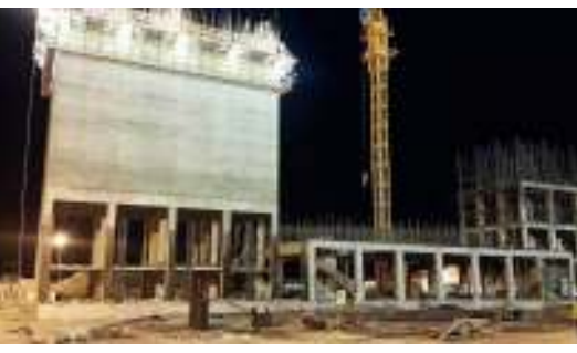
Sayga Flour Mill L Project-Slip Form